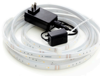
16 ft. Flexible Light Strip x1